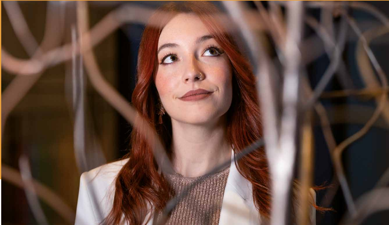
Programme started in 1982