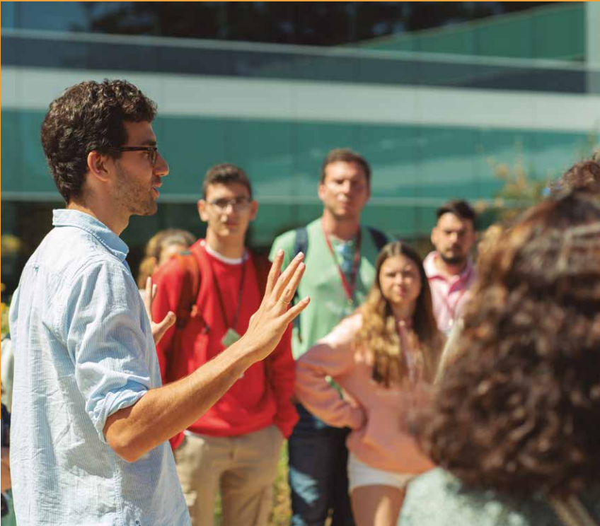
Programme started in 2012

We promote excellence in training and research talent at the best universities and research centres in the world.