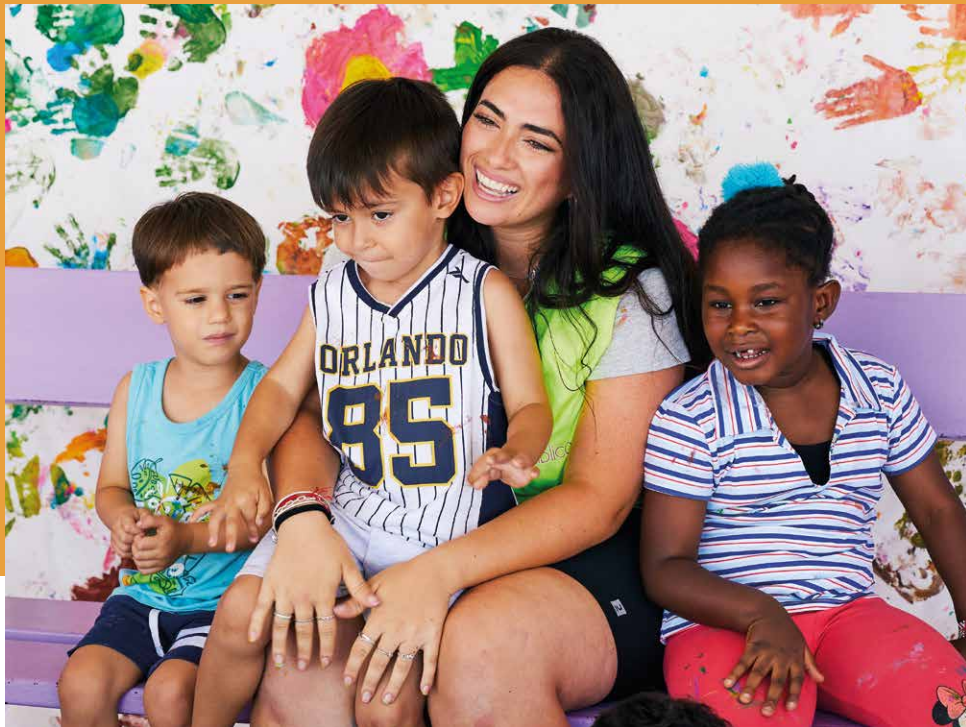
Programme started in 2007

We use technology and innovative digital experiences to foster the development of 21st-century skills among teachers and pupils in vulnerable environments on the planet.